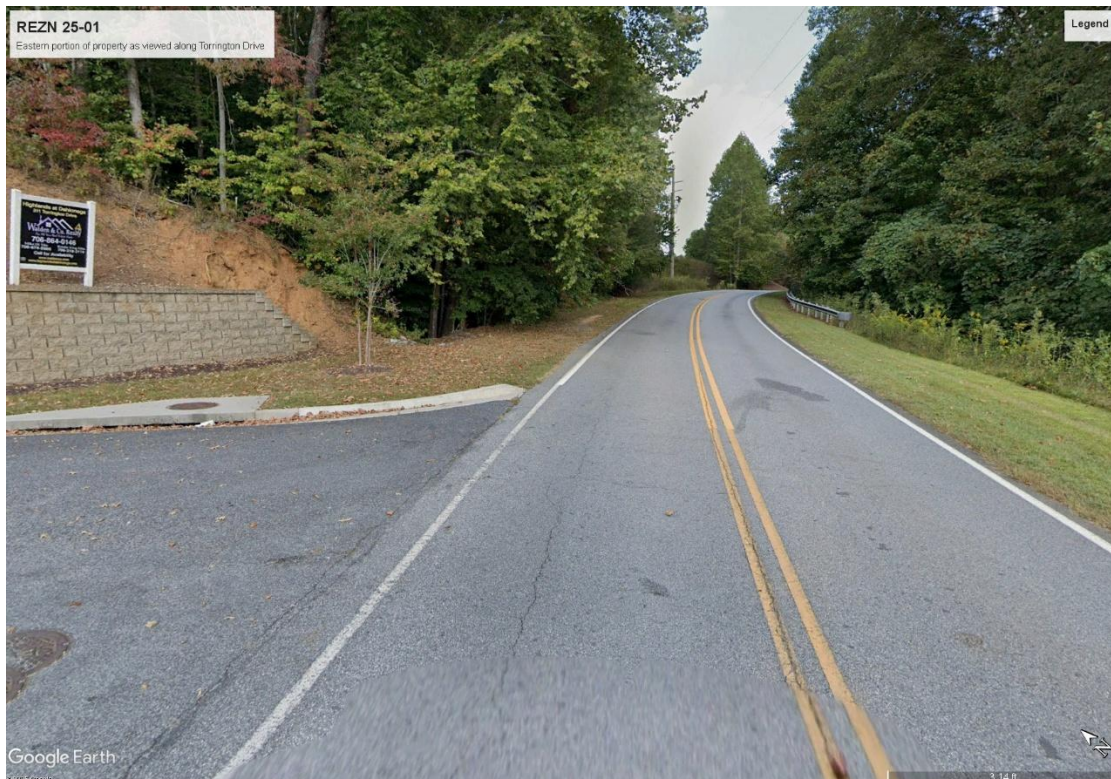
Eastern Portion of Property as Viewed along Torrington Drive