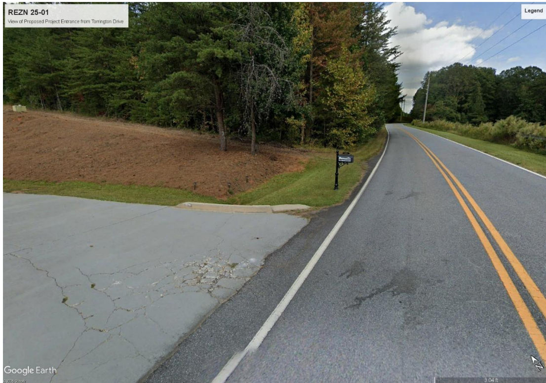
View of Project Entrance from Torrington Drive